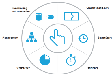
Figure 3. 3PAR Software Suites enhance the agility and efficiency of your infrastructure.

Building on HP 3PAR Operating System software, HP offers a range of standalone software products and bundled software suites to enhance the agility and efficiency of your infrastructure and enable you to eliminate compromise.